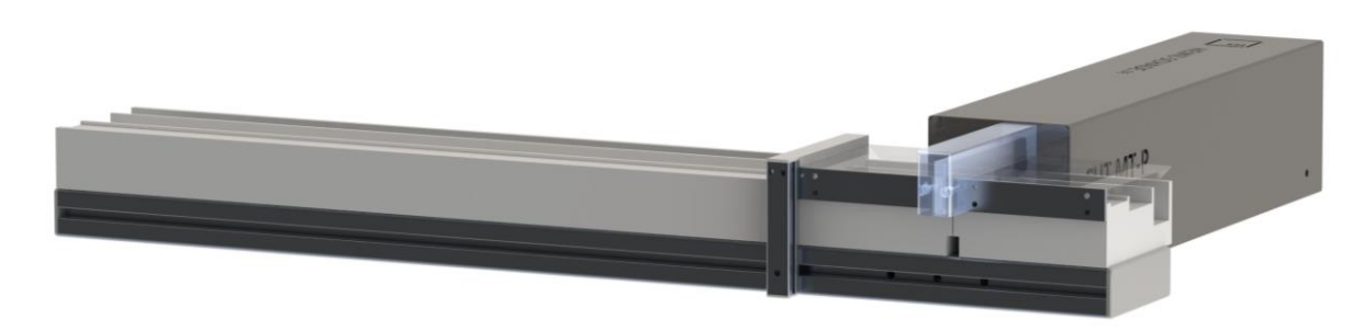
Cut MT-P with pneumatic blade

The Cut MT is a simple machine that is perfectly suited for its task of shortening long hoses precisely. When the hoses are inserted and clamped, the carriage is used to place the hoses in the grooves almost without tension. After complete insertion, the knife, which can be set freely regarding its angle, will cut all hoses at the same time. Due to its simple operation, the machine can easily be operated by a single employee. Hose size must be indicated when ordering.