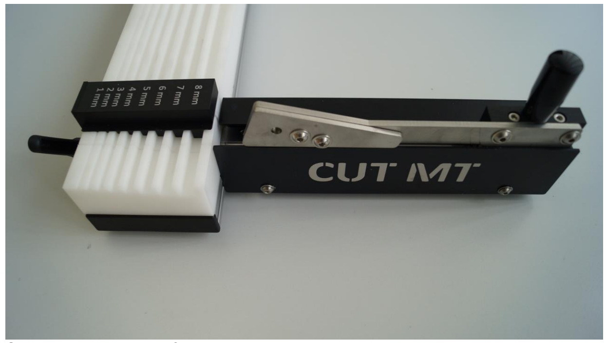
Cut MT with guidance's from 1-8 mm or on customer's request