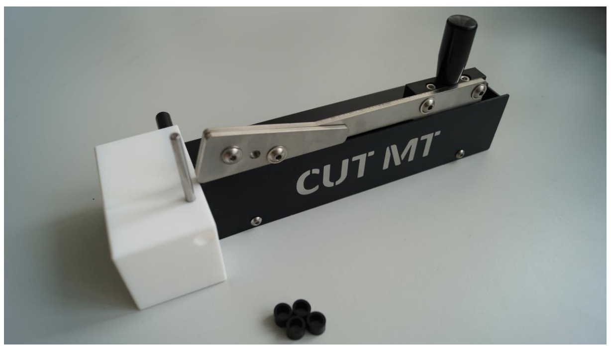
Cut MT Lite with fix stop for the exact cutting of one tube size